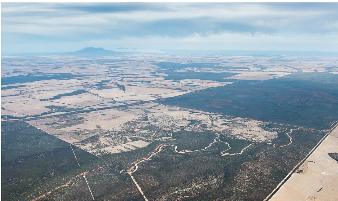
Image: A mosaic of land uses in the Fitz-Stirling section of Gondwana Link, WA.

The Valuing Sustainability Future Science Platform is focused on transdisciplinary science to support the development of principles, measures and metrics to drive societal shifts towards sustainability outcomes.