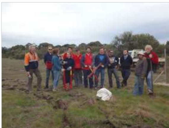
Visiting senior scouts assist with planting in Ranges Link.