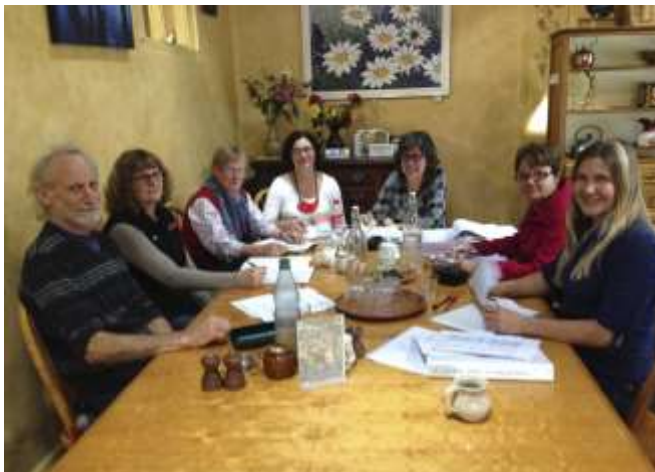
Ongoing conservation planning by the Ranges Link group.