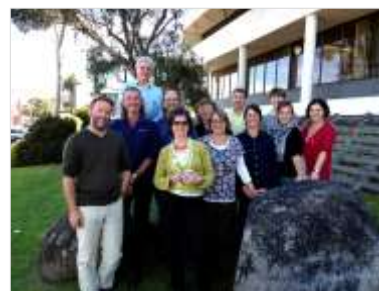
Team updating the Fitz-Stirling Conservation Action Plan.

Work independently and with organisations and individuals to ensure a steady stream of funding and benefits are available to those working to achieve essential parts of the ecological vision for Gondwana Link, with the end result being exponential progress made against clear targets.