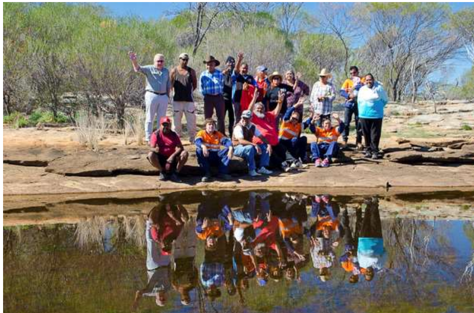
Ngadju Conservation Planning team near Norseman.