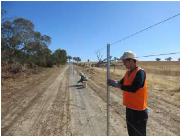
Predator proof fencing goes in at Balijup.