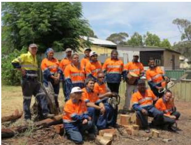
Ngadju team doing chainsaw training.

Green Skills were instrumental in the construction of a 4.3km predator proof fence to create a 111 hectare conservation enclosure on Balijup Farm, in Gondwana Link's Stirlings to Forest section. Once the foxes and cats were removed bandicoots were introduced to the area. The feral proof enclosure provides a safer breeding habitat for a number of birds and will be used to build up numbers of mammals lost from the area – a critical step in a wider recovery.