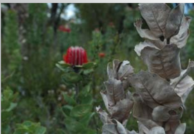
Banksia death as a result of Phytophthora cinnamomi infection.

All of the conservation targets suffer from multiple ecological stresses, which together reduce their viability. Our process identified these critical stresses, then drilled deeper to determine the specific sources of those stresses. Identifying the source of the stress means that strategies are aimed at removing that source, rather than only addressing the symptoms.