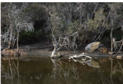
Reducing sediments and nutrients in the creeks within the Fitz-Stirling (above) will benefit the estuaries (below).