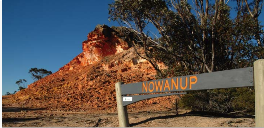
Selection of properties for acquisition is informed by the landscape plan. (Strategy 1)

We designed six strategies to achieve our conservation objectives in the Fitz-Stirling area, all of which involve cooperation with others. Each conservation strategy directly addresses the viability of one or more targets, or the critical threats to the targets.