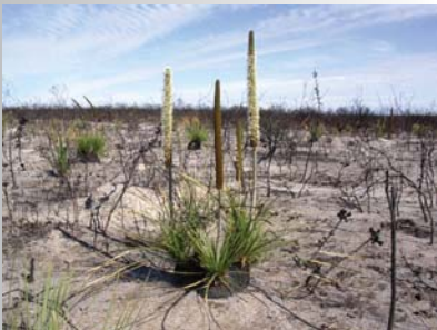
The Fitzgerald River National Park has seen many fires in recent years.