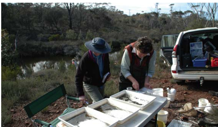
Ecologists from Gondwana Link and the Centre for Excellence in Natural Resource Management (CENRM) are working together on monitoring pools.

The fundamental question facing any team is: “Are our strategies working?” To answer this question, we are collecting data on a number of indicators that gauge how well we are keeping the critical threats in check and, in turn, whether the viability of our conservation targets is improving. A monitoring framework for the viability of our targets has been developed (below) and is now being implemented.