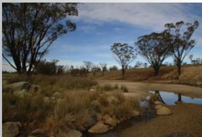
Continued loss of vegetation adds to the problems of erosion, filling of creeks and poor water quality.