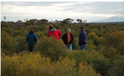
Restoration of native vegetation systems and their associated communities is one of the main strategies in Gondwana Link.