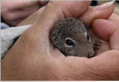
Dibbler and other animals are affected by predators.