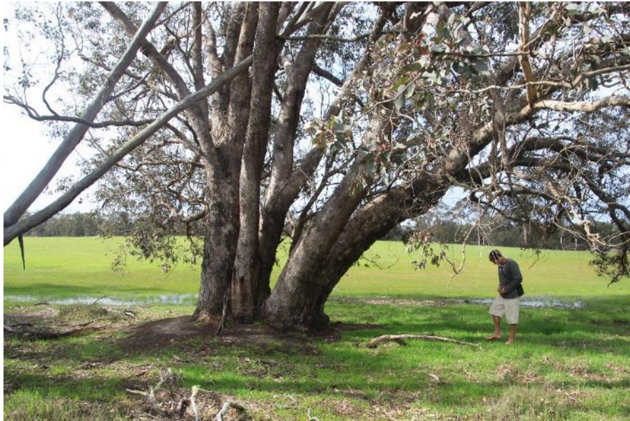
A large Eucalyptus rudis