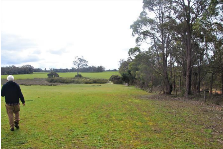
South east corner of the property