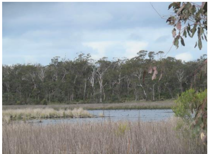
Boggy Lake in the adjacent Department of Water (DWER) property