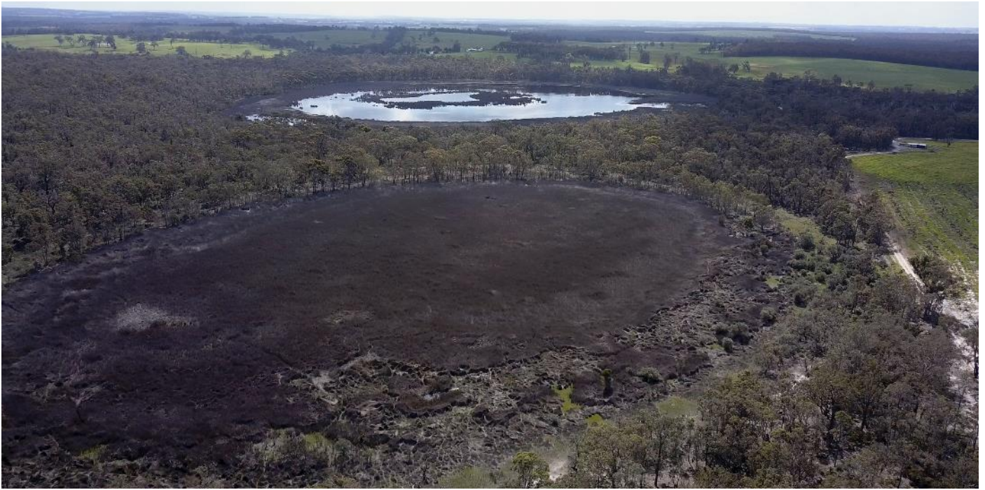
Aerial view of Boggy Lake in the adjacent Department of Water (DWER) property