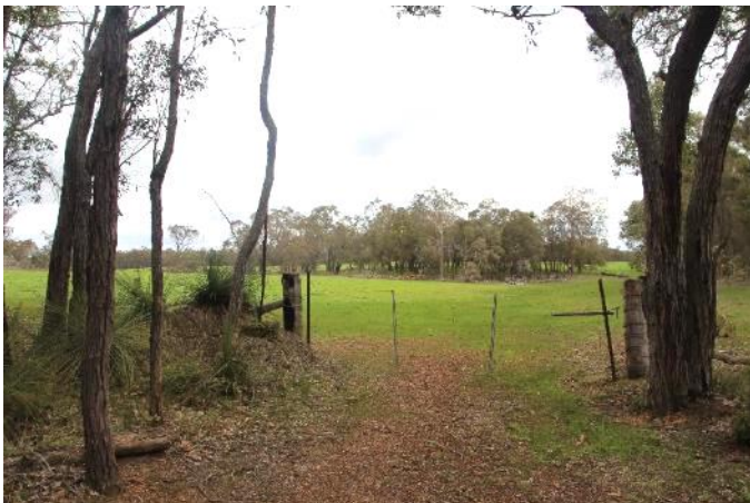
North-east corner gate