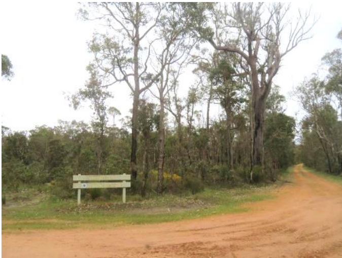
Tootanellup Nature Reserve