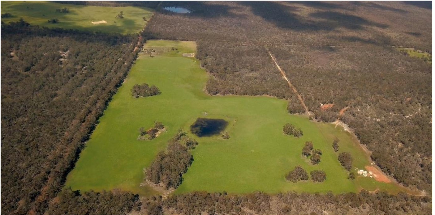
Aerial view of property (Lot 2249)