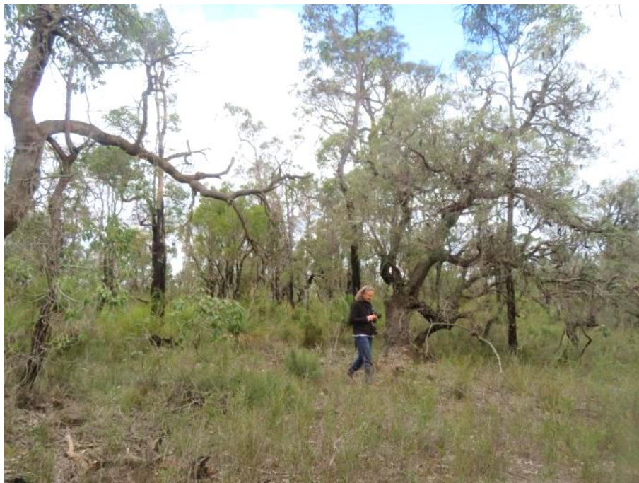
Banksia littoralis in swamp in Tootanellup Nature Reserve