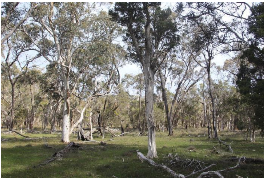
Wandoo and Yate trees in the remnant vegetation on the property