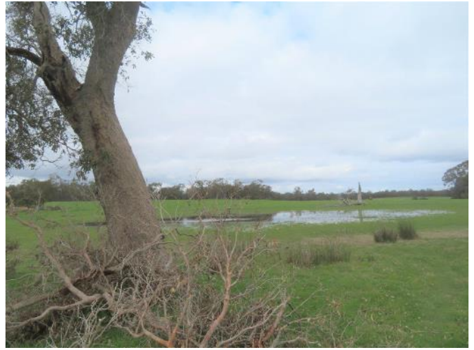
Wetland on the property