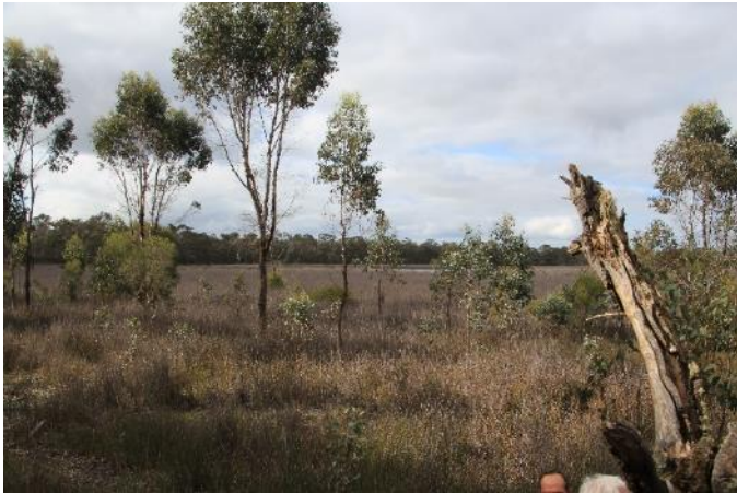
Boggy Lake in the adjacent adjacent Department of Water (DWER) property