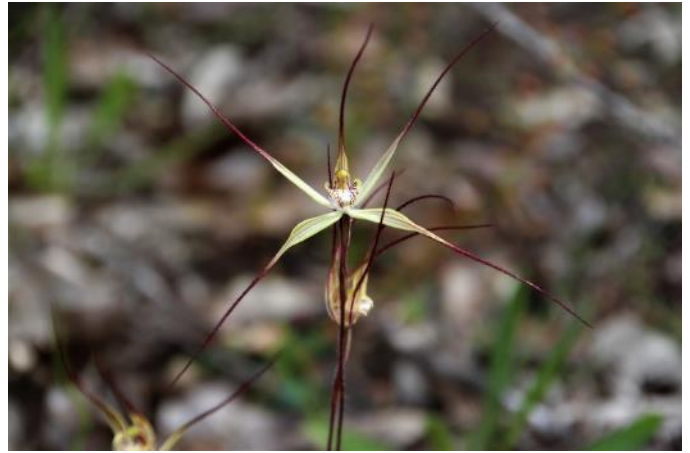
Spider orchid in Boggy Lake