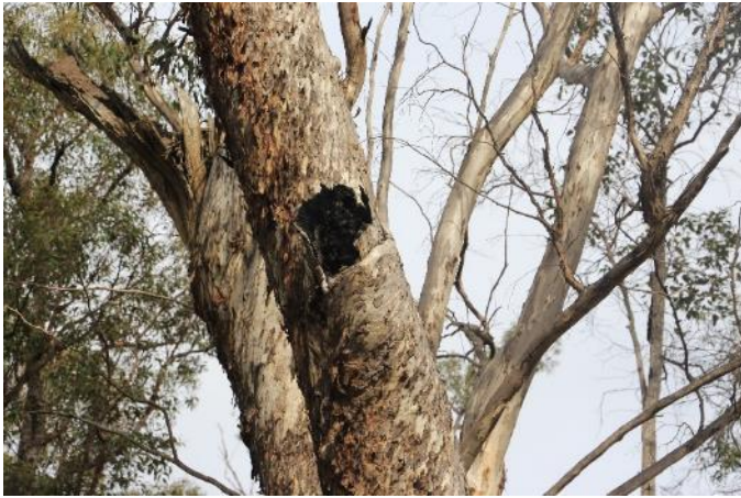
Old wandoo in Boggy Lake area