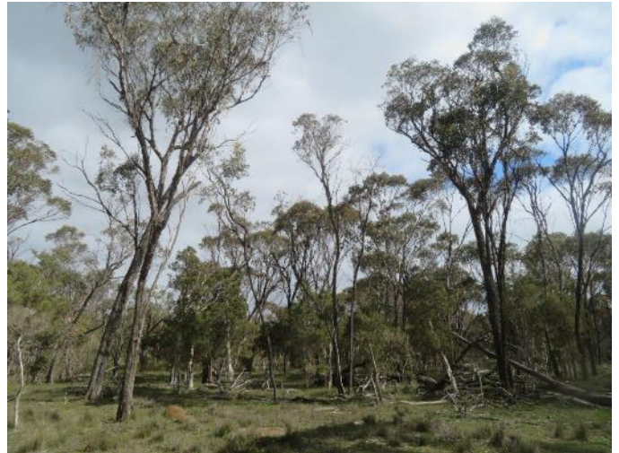
Wandoo and Yate trees in the remnant vegetation on the property