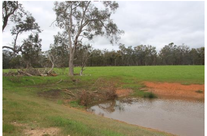
Dam at the north of the property