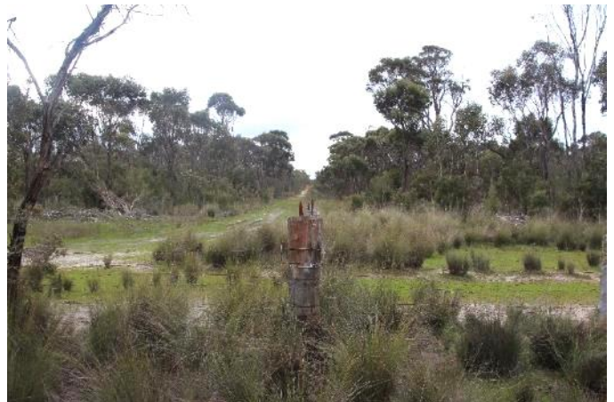
South-west corner of property