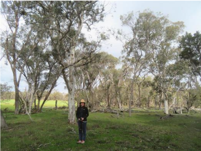
Wandoo and Yate trees in the remnant vegetation on the property