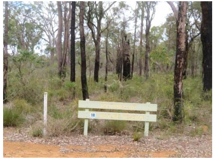
Tootanellup Nature Reserve