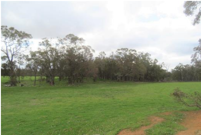
Small Marri forest remnant on north east side. Cleared area a possible site for camping.