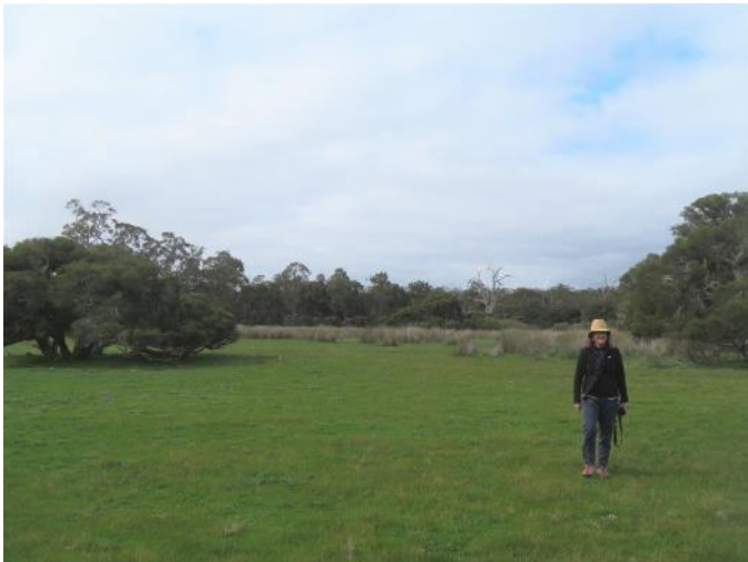
On the property with Melaleuca trees in paddock