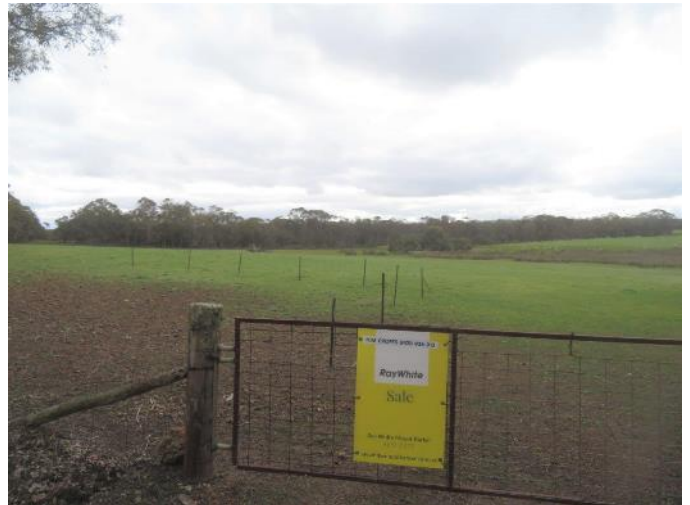
Entrance to property Lot 2249 Rocky Gully Road