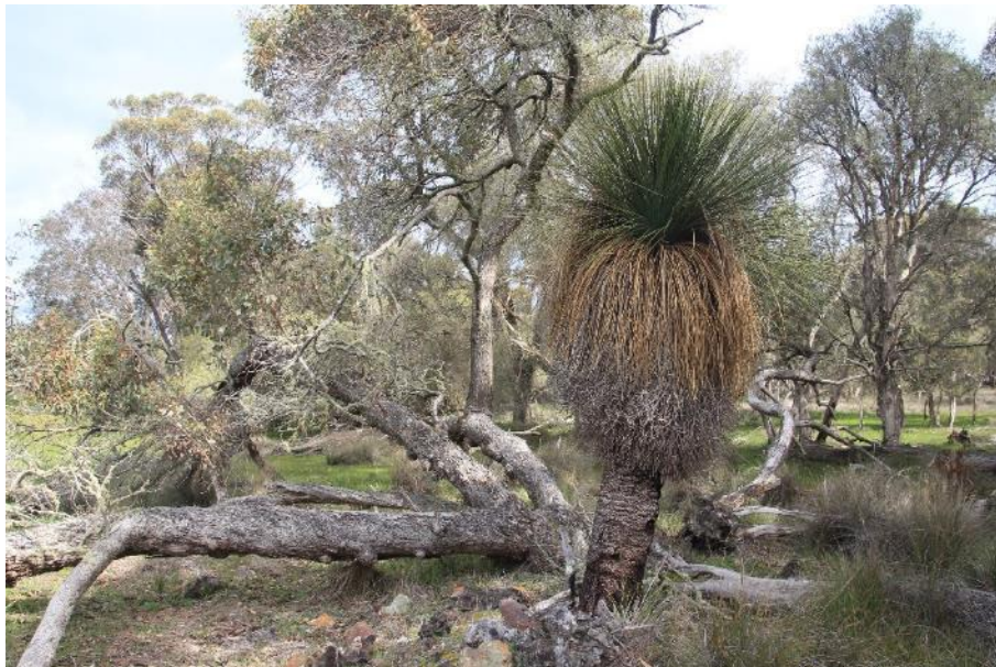
Eucalyptus decipiens and Balga ( xanthorrhoea preissii )