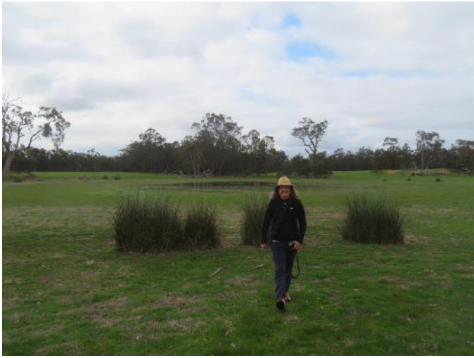
Wetland on the property