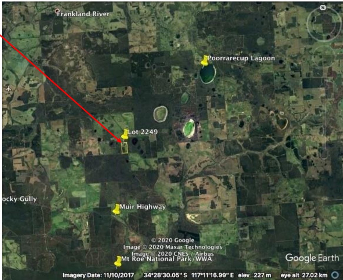
Figure 6 Property Location

Eco-restoration on the property will be undertaken to strengthen the linkage between these reserves. Around 28 hectares of cleared land (including a wetland) will be carefully restored according to current best gold standard eco restoration practices.